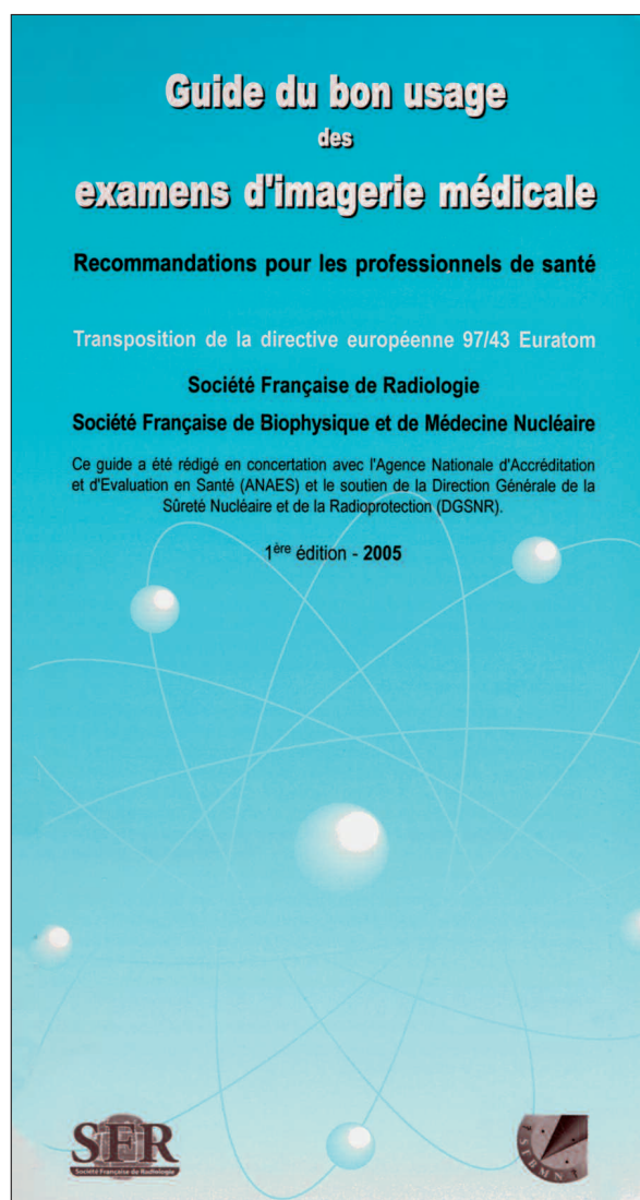
Guide of good practice for medical imaging examinations published by the French Radiology Society

With regard to the radiotherapy events, the notifications received in 2008 come from 56 of the 180 establishments,