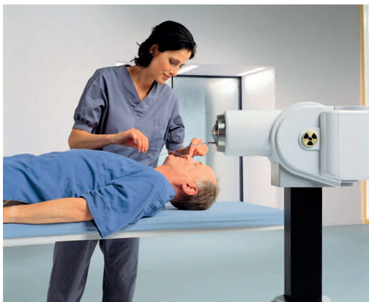
Insertion of an iridium wire for brachytherapy

up into several sequences (pulses). The patient does not therefore carry the sources permanently, which is more comfortable and enables him to receive visitors. This technique, which is likely to be increasingly used, significantly improves the radiation protection of the personnel, who can now work with the patient without being exposed, once the source has been returned to the applicator's storage container.