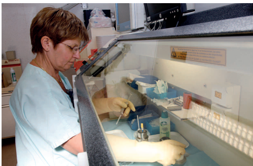
Handling of radioactive products in the Nantes university hospital nuclear medicine unit (Loire-Atlantique département ) – September 2007

Technetium 99m, which is the radionuclide used in about three-quarters of all nuclear medicine examinations (see