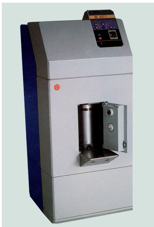
Blood products irradiator

The irradiator control console must be fitted with a control key which is to be removed from the device and stored in a safe place under the responsibility of an individually designated person.