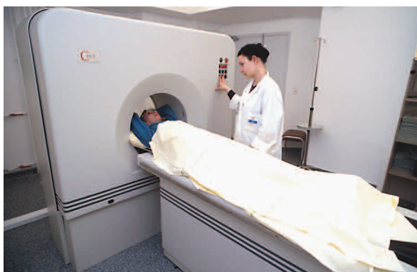
Positron Emission Tomography machine in Tenon hospital, Paris