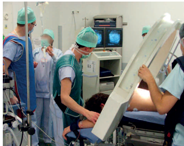
Interventional radiology in the operating theatre

This technique, which is used to explore the blood vessels, is based on digitalisation of images before and after injecting a contrast medium. Computer processing masks