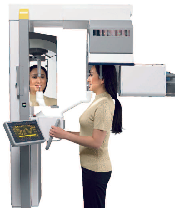
Panoramic dental radiology appliance

In the dental field, 2008 saw the continued development of volumetric 3D tomography, a technique derived from