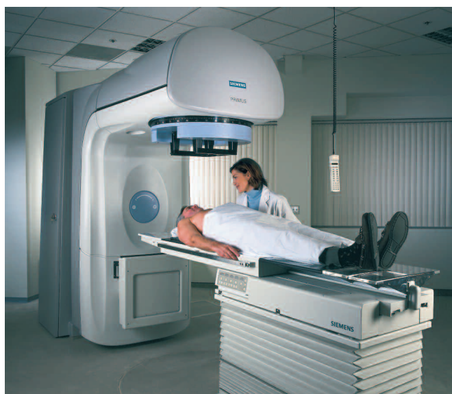
Particle accelerator for radiotherapy

It was originally developed to treat non-cancerous pathologies in neurosurgery (artery or vein malformations, benign tumours) and uses specific localising techniques, such as the Leksell stereotactic frame for example,