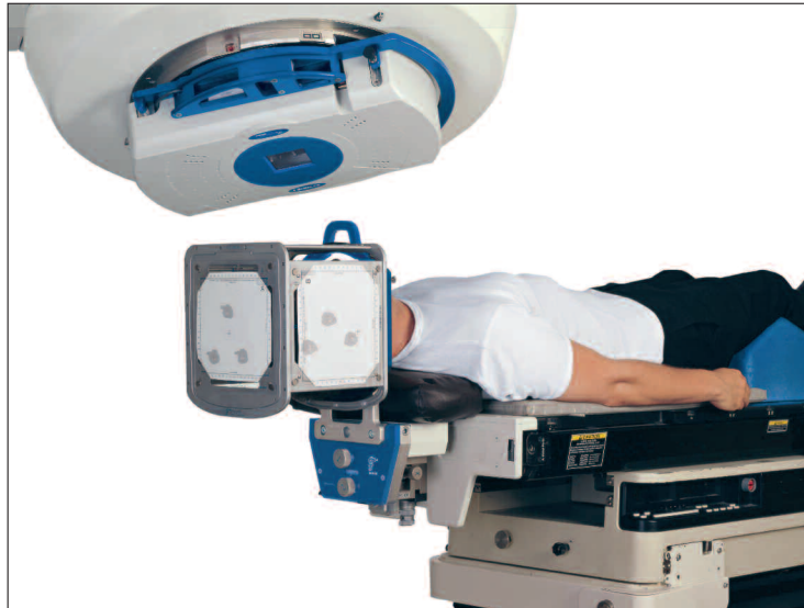
Use of a stereotactic frame for external radiotherapy

to ensure precise localisation of the damage. It is being increasingly used to treat cerebral metastasis.