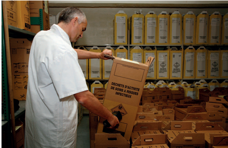
Inspection by ASN's Nantes division in the Nantes university hospital radioactive waste area (Loire-Atlantique département) – September 2007

have to comply with specific layout rules, the main provisions of which are described below.